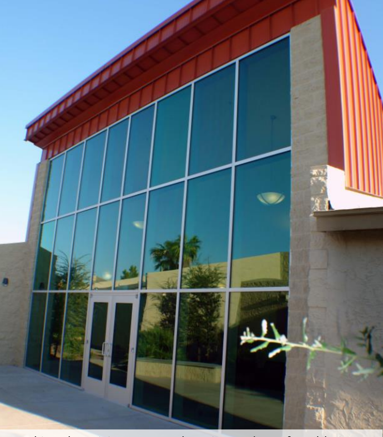
Making the crisis center welcoming and comfortable is an important first step (RI Crisis in Peoria, Arizona).